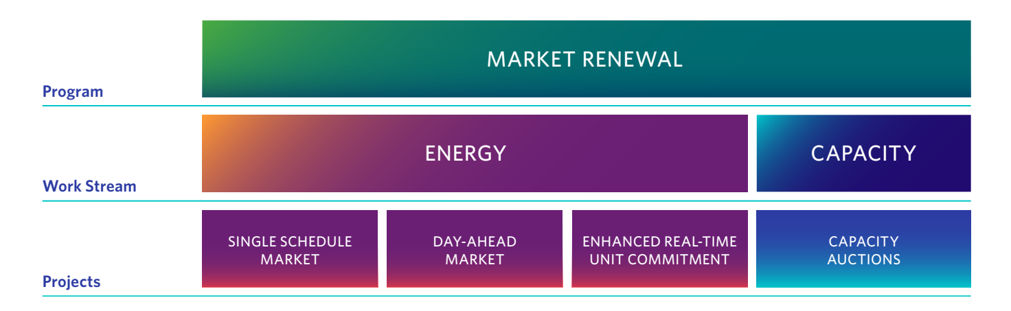
FIGURE 1: MARKET RENEWAL PROGRAM WORK STREAMS